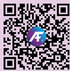
Direct site link

If you need any help or have questions please reach out to